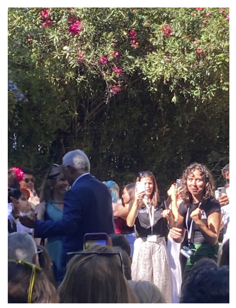
Figure 6. Prime Minister dancing forró. Photo by author, 10 September 2022.

is one of the oldest as well as the largest, having mobilised approximately twenty thousand revellers in its 2023 carnival parade. The group had used CBL's facilities for classes and, according to Azevedo, was the only group for which Costa's Office of Events had expressed specific interest.