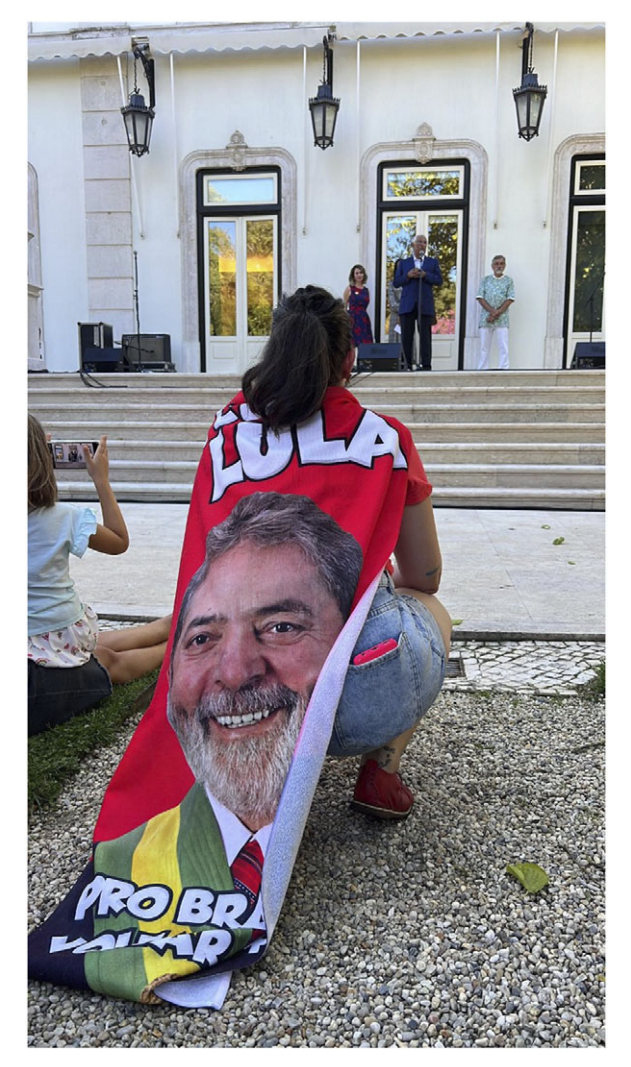
Figure 4. A Lula supporter listening to Costa's speech. Photo by author, 10 September 2022.

Bicentennial performances, no political content was needed to make a political point. Though Baque Mulher, for example, didn't make an explicit political statement, like Gira, the simple fact of women occupying traditionally male roles made a political point, in this case in playing the thunderous drums of maracatu. The forró class, where even the prime minister danced, "was a deconstruction of an extremely formal space, the house of one of the greatest authorities of the country.... It was a subversion of what that space is used for" (Figure 6). A workshop for children provided an opportunity that is usually neglected because, as Azevedo noted, "we neglect women and we neglect mothers" (Figure 7). Colombina Clandestina and Puta da Silva, however, made their politics explicit but in creative and coded ways, and it is to their performances that I now turn my attention.