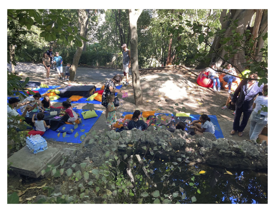
Figure 7. Workshop area for children. Photo by author, 10 September 2022.

Colombina is also the most openly political of Lisbon's blocos, listing in its public materials and reinforcing through performance its three main political pillars of feminism, diversity, and public space. The bloco's leader, Andréa Freire, had come to Lisbon in 2016 for a graduate program in Communication and Trends, eventually completing a master's degree in Culture and Communication at the University of Lisbon, a program in which students are encouraged to think about the dissemination of culture strategically. Along with two other students, the vision for Colombina emerged as a project for a class assignment, and the three defined the political pillars of the project from the beginning since "we started in academia, and we had to formulate what this bloco was about" (Andréa Freire, interview, 5 October 2022). For Freire, beyond promoting Lula and denouncing Bolsonaro, the objective on the occasion of the Bicentennial was to provoke thought about the