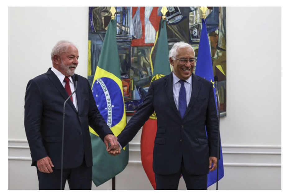
Figure 12. Image of Lula and Costa, source Público.