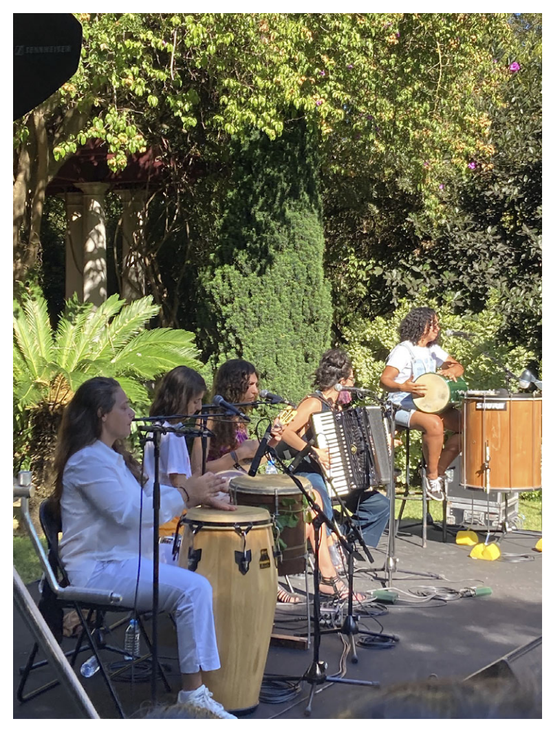
Figure 5. All-women samba group Gira. Photo by author, 10 September 2022.